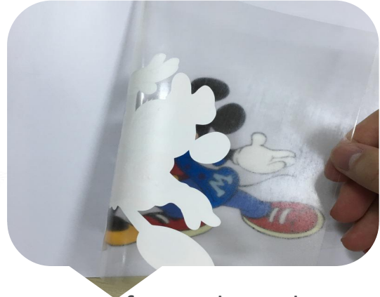
Use Transfer Mask get the design