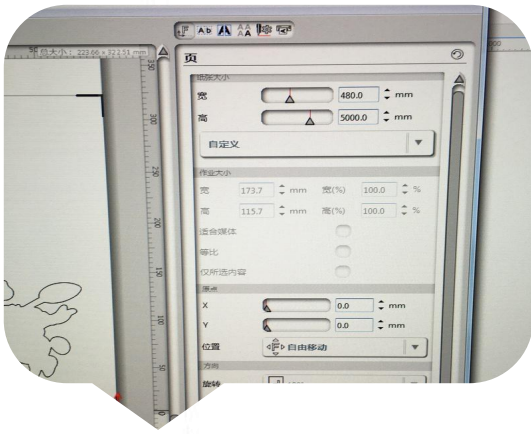
Open design on CorelDRAW X7 make cutting