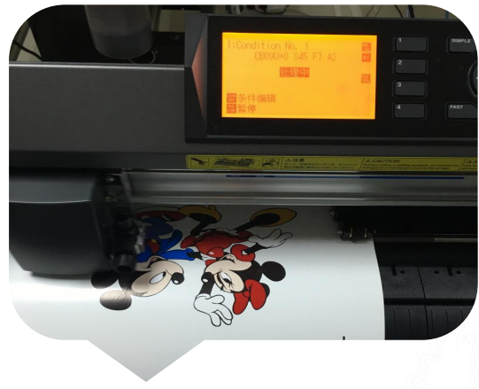
Cut on GRAPHTEC plotter, Speed:45cm/s, Thickness: 7