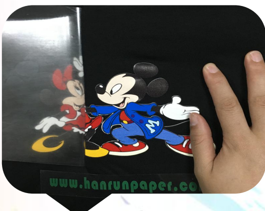
Cold peel the transfer make