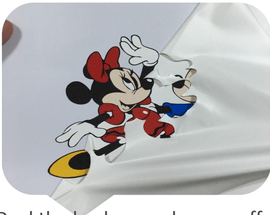
Peel the background paper off design get out the design