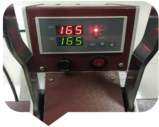
Preheat press machine suggested at 165°C(320F), 15s