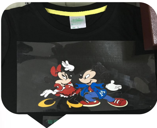
Design face-up on garment for heat press