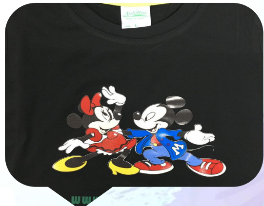
Get the garment ready