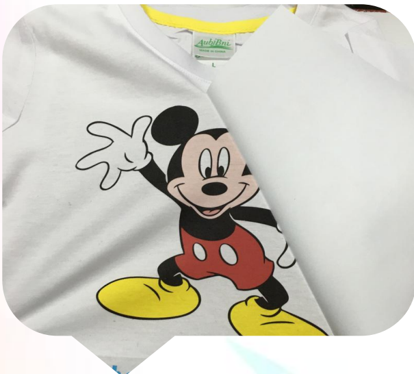
Hot peel the base paper