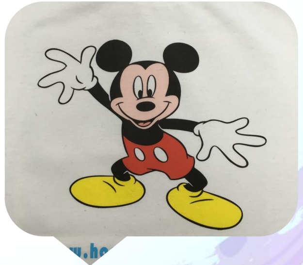
If you need soft touch feeling, can pull the fabric lightly