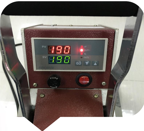
Preheat press machine suggested at 190°C(374F), 15 seconds