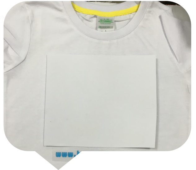
Design face-down on the garment