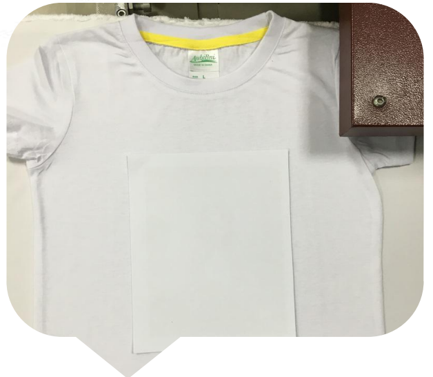
Design face-down on the garment