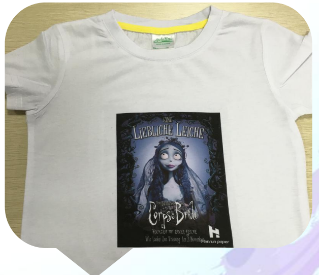
If you need soft touch feeling, can pull the fabric lightly