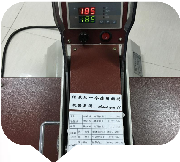
Preheat press machine suggested at 185°C(365F), 20 seconds