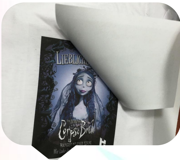
Hot peel the base paper