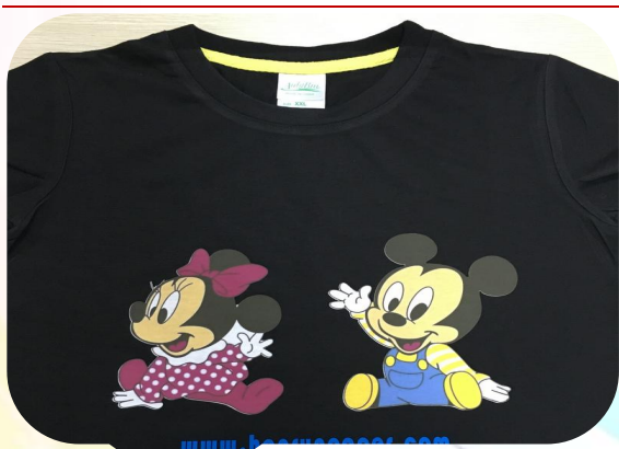
If you need soft touch feeling, can pull the fabric lightly