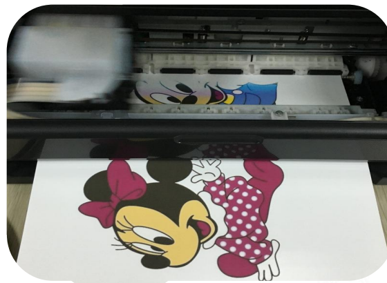
Printer set 'photo quality', 'high quality printing'