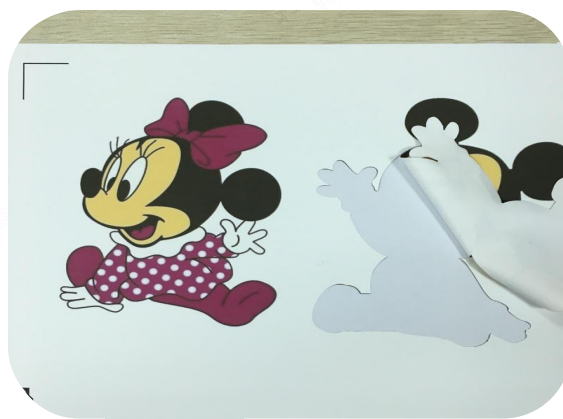
Peel out the design