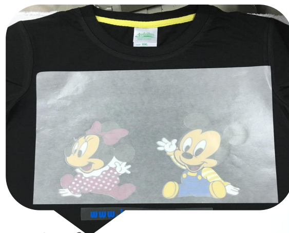
Design face-up, cover an isolation paper