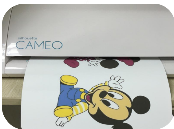
Cut on Silhouette CAMEO plotter, Speed: 6cm/s, Thickness: 2