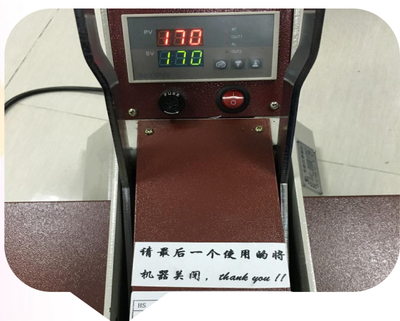
Preheat press machine suggested at 170°C(338F), 10 seconds